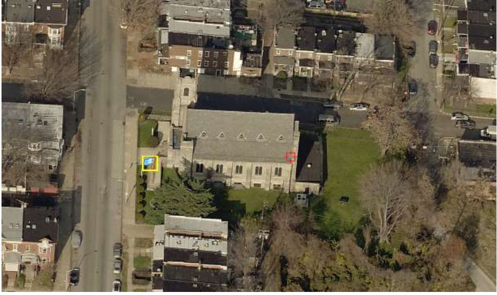
View from the south.