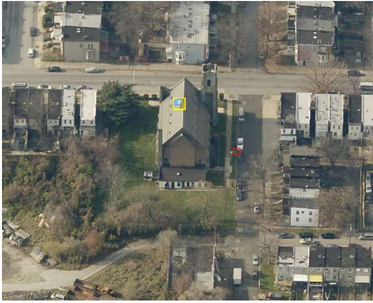
View from the east.