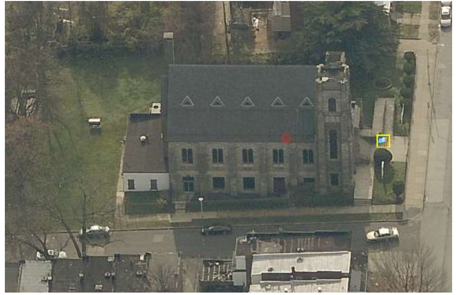
View from the north.